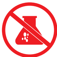
NO USE OF CHEMICALS