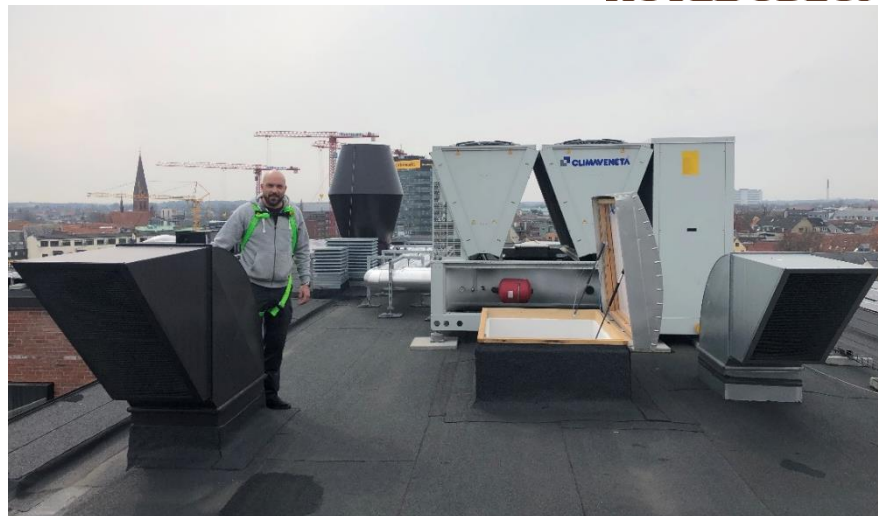
Air Inlet channels

JIMCO A/S remedied this by installing Kitchen Pollution Control (KPC) in the kitchen hoods.