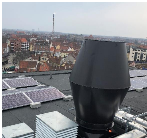
Air outlet from the kitchen