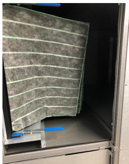
Bag filters from exhaust air